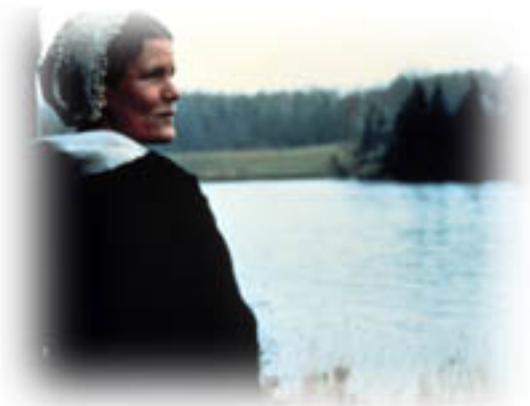
From the Film, A Midwife's Tale

Even though technology has expanded our ability to record information-- diaries can be found on paper, computer, video, film, or audio tape--the intrinsic value of diary writing remains the same. The records we leave behind will serve future historians as they attempt to understand the time we live in. What they will deduce about our lives and our society remains to be seen.