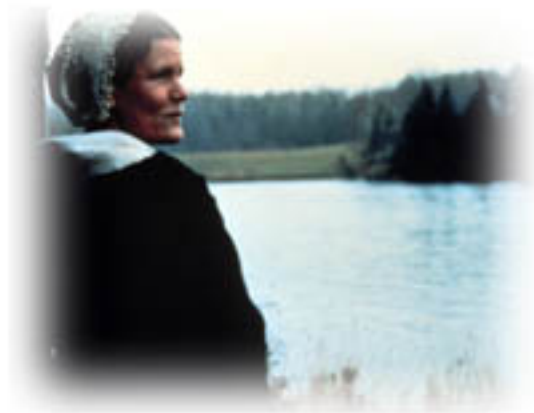
From the Film, A Midwife's Tale

The nation had changed dramatically in just under thirty years. The transition, however, was not an easy one, for either the military, political, and business leaders who had led the colonies to independence or for ordinary citizens like Martha and Ephraim Ballard.