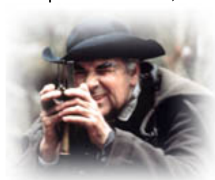
From the Film, A Midwife's Tale