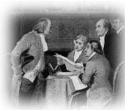
Discussing the Declaration of Independence

Not surprisingly, Wood relates, the Founding Fathers expressed disappointment and despair in the Revolution's aftermath. John Adams feared that greed, disobedient children and apprentices, and turbulent schools and colleges would weaken the Republic. In 1813, he asked when, where and how "the present chaos" would be "arranged into Order." Thomas Jefferson believed that the nation was moving